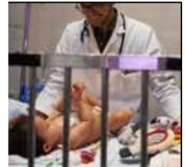
One THCC victory was expanded coverage for children.

Of the 46 million Americans currently without access to health care, over a million live in Tennessee. Recognizing that access to health care is a major obstacle for too many people in their state, concerned citizens have worked to address this issue through the Tennessee Health Care Campaign (THCC), an organization which receives funding from the Catholic Campaign for Human Development (CCHD).