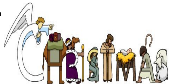
CHRISTMAS IS THE CELEBRATION OF THE BIRTH OF JESUS, THE SAVIOUR OF MANKIND